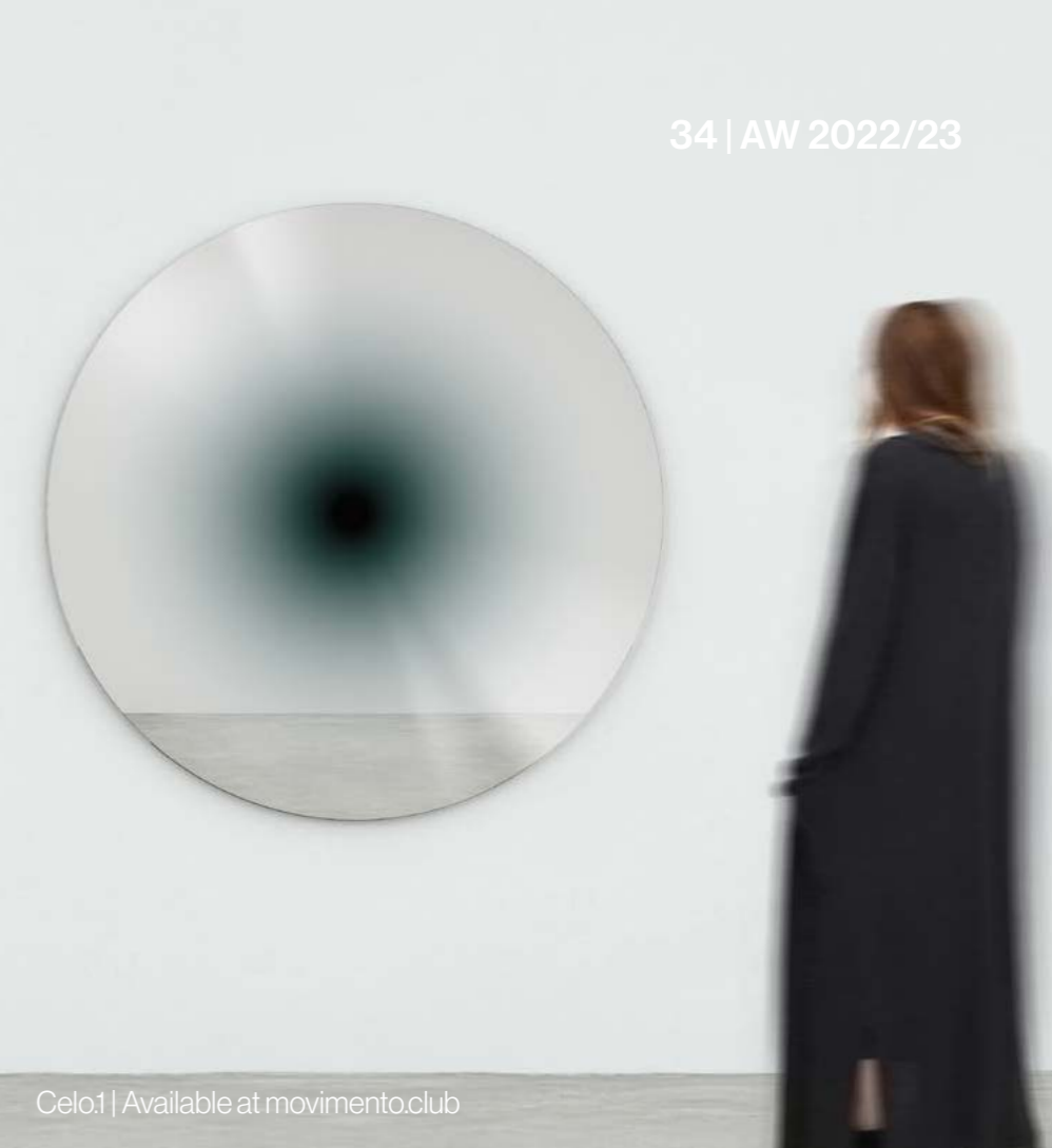
Celo.1 | Available at movimento.club