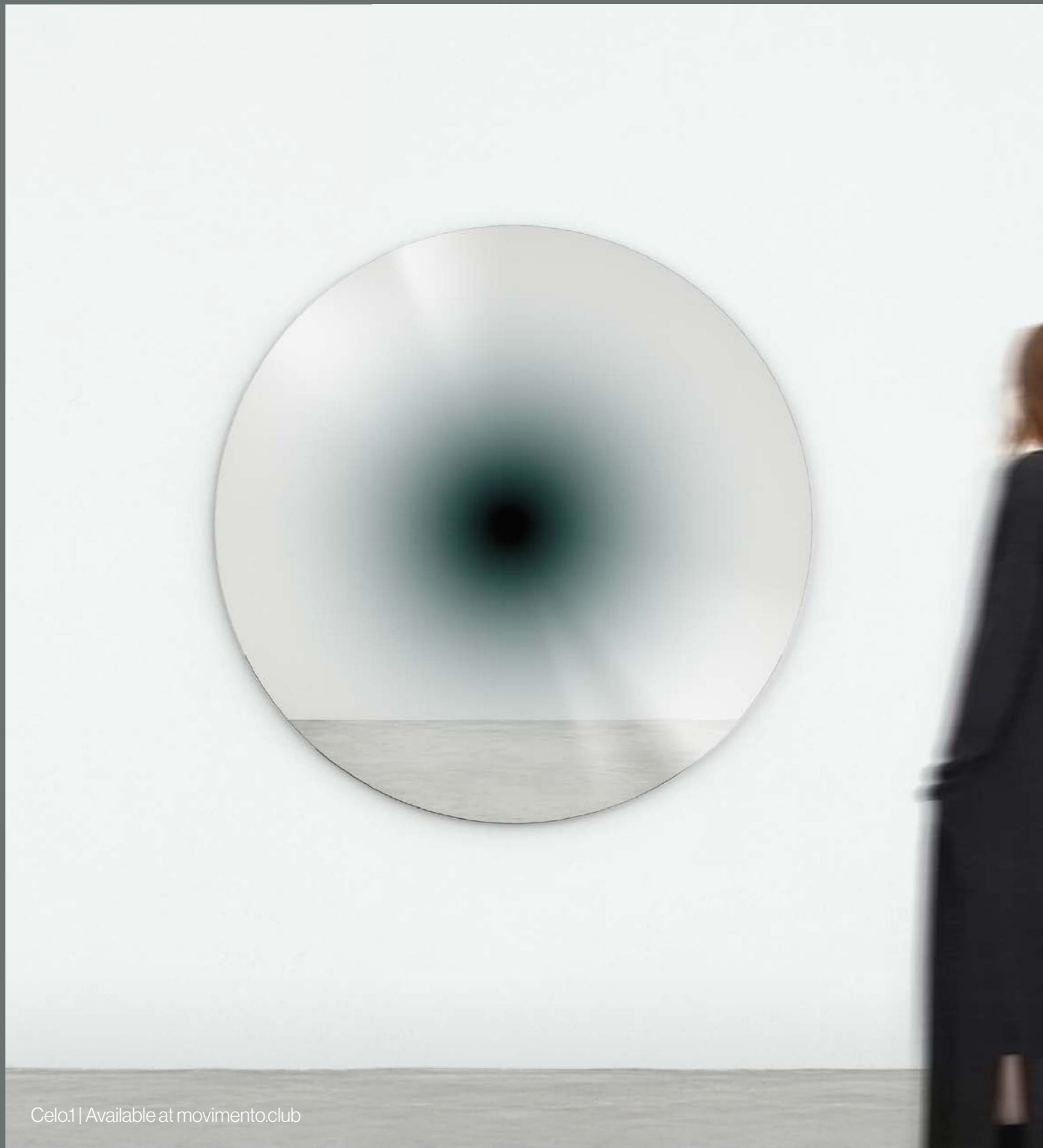
Celo1 | Available at movimeto.club