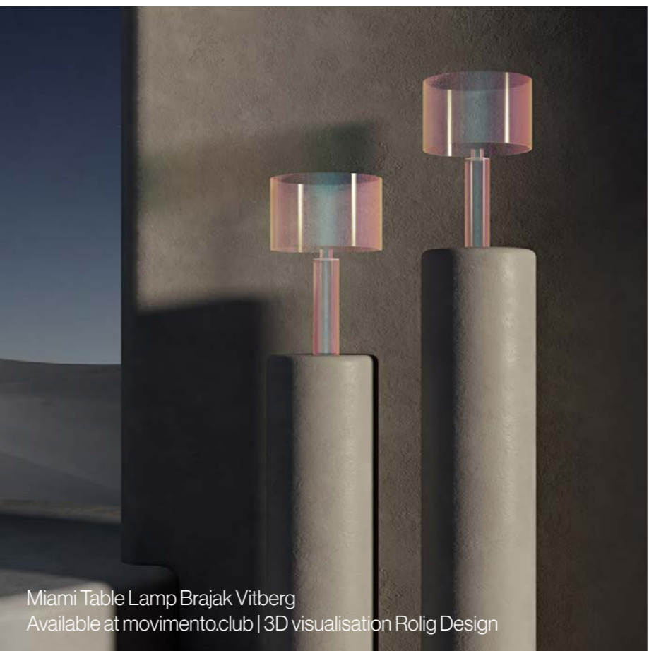
Miami Table Lamp Brajak Vitberg Available at movimento.club | 3D visualisation Rolig Design