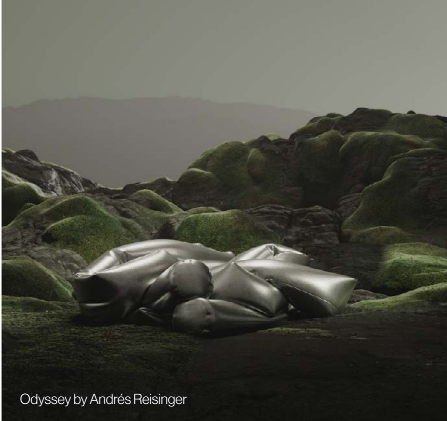
Odyssey by Andrés Reisinger

The influence of the virtual on the Home aesthetic is reflected in objects with an illusory quality.