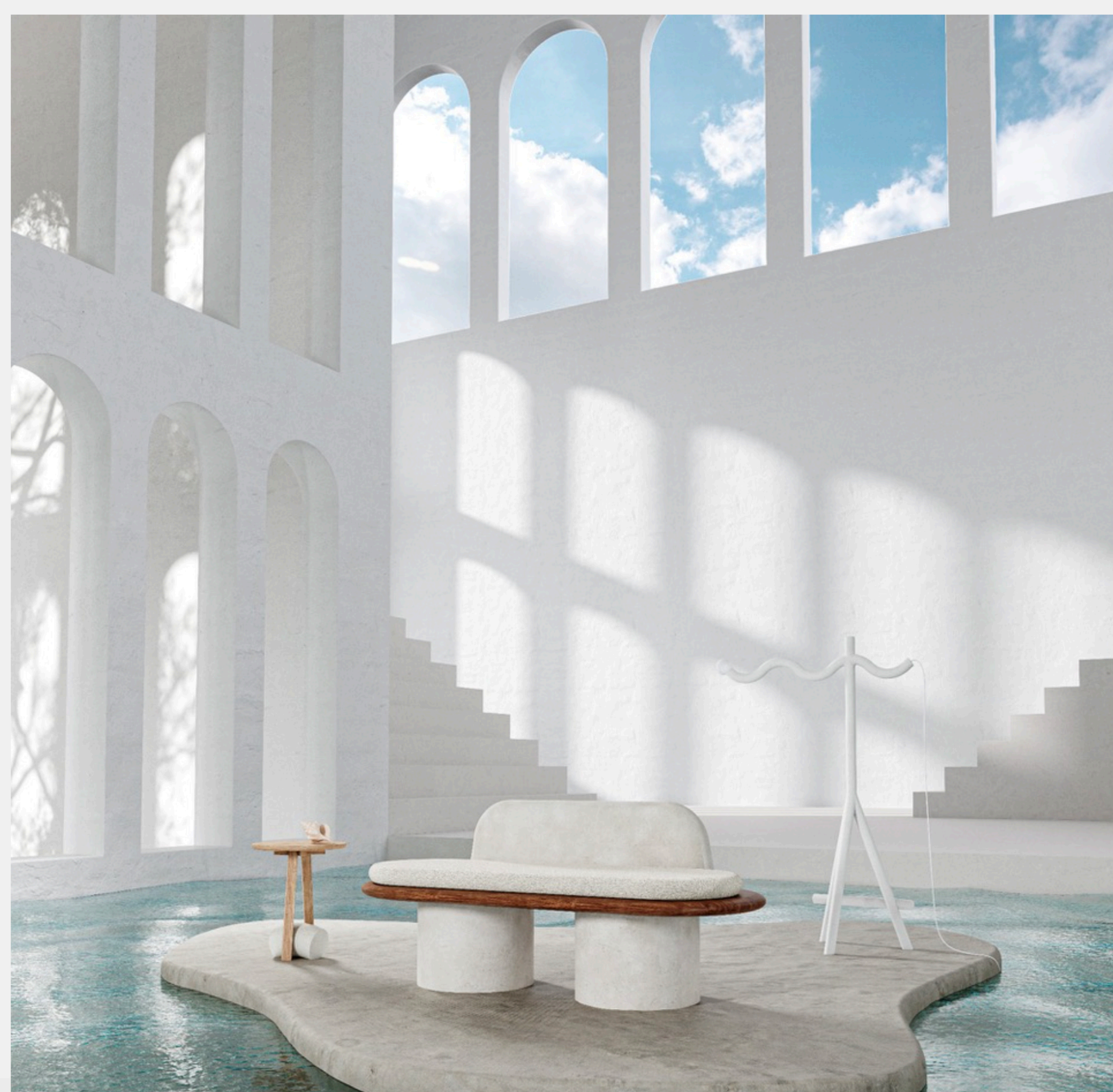
Featured in this scene: (from left to right) Poise side table by Desmond Lim, Pillars Sofa by Jackrabbit Studio and Wave Lamp on Slicks by Hot Wire Extensions

From October 1, 2020 until October 31, 2020