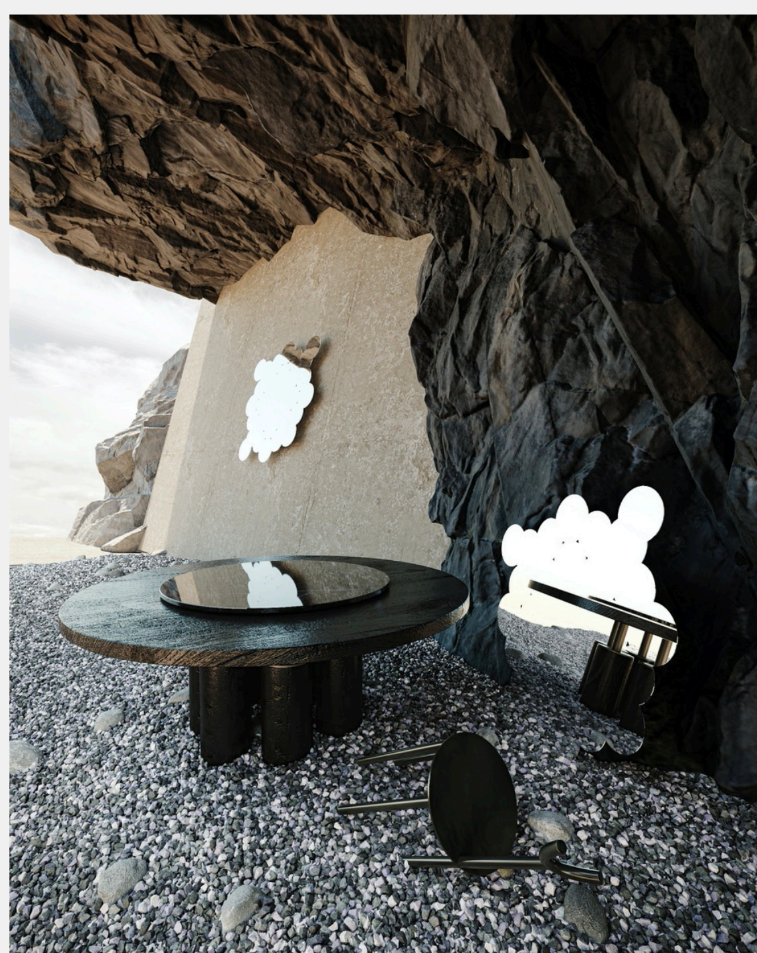
Featured in this scene: Room for Irregularities Chair by Walac, Mammut Table by Studio Effe, Kit Christo Mirror by ASATA.