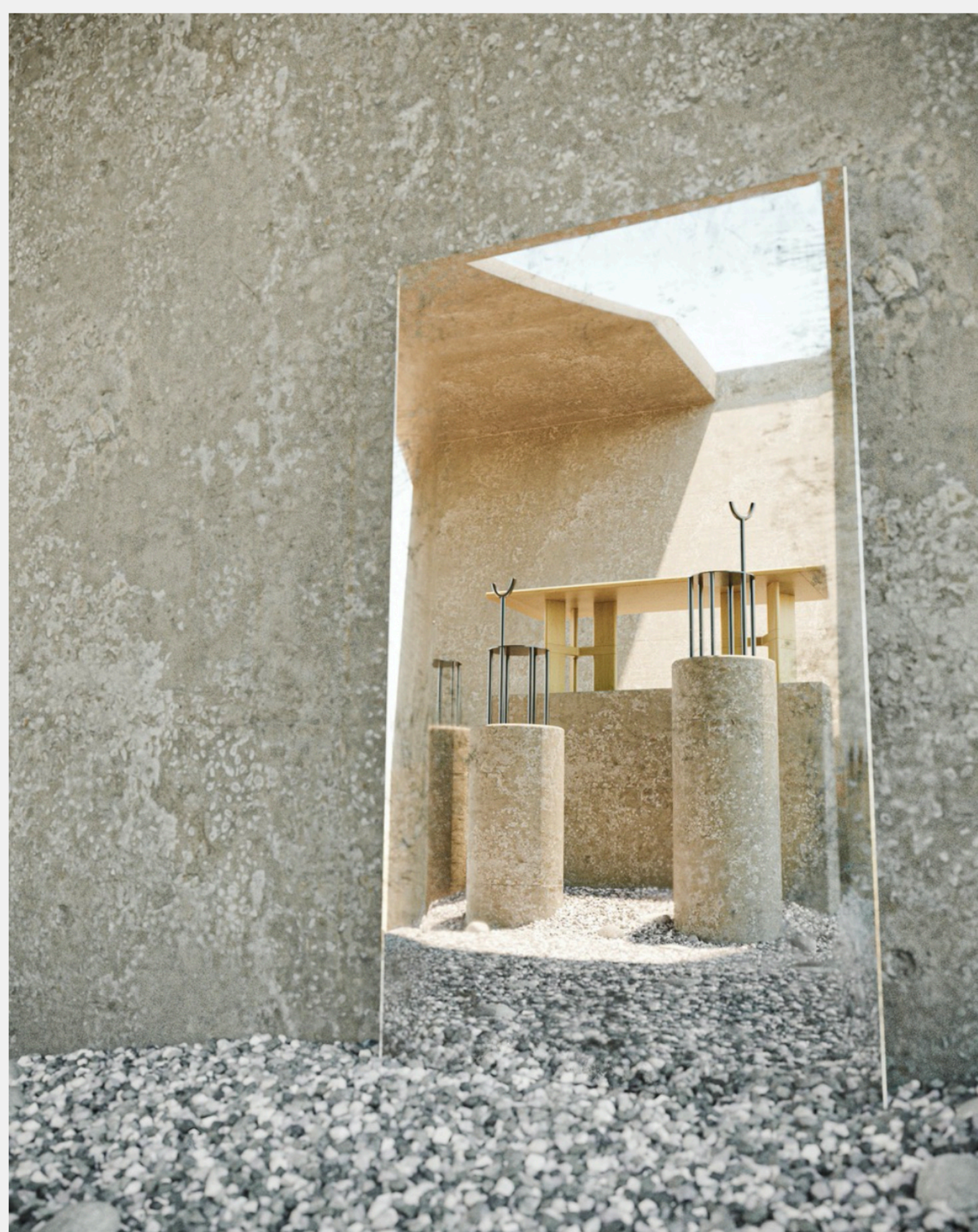
Featured in this scene: Room for Irregularities Chair by Walac, Elph Table by Wangan.