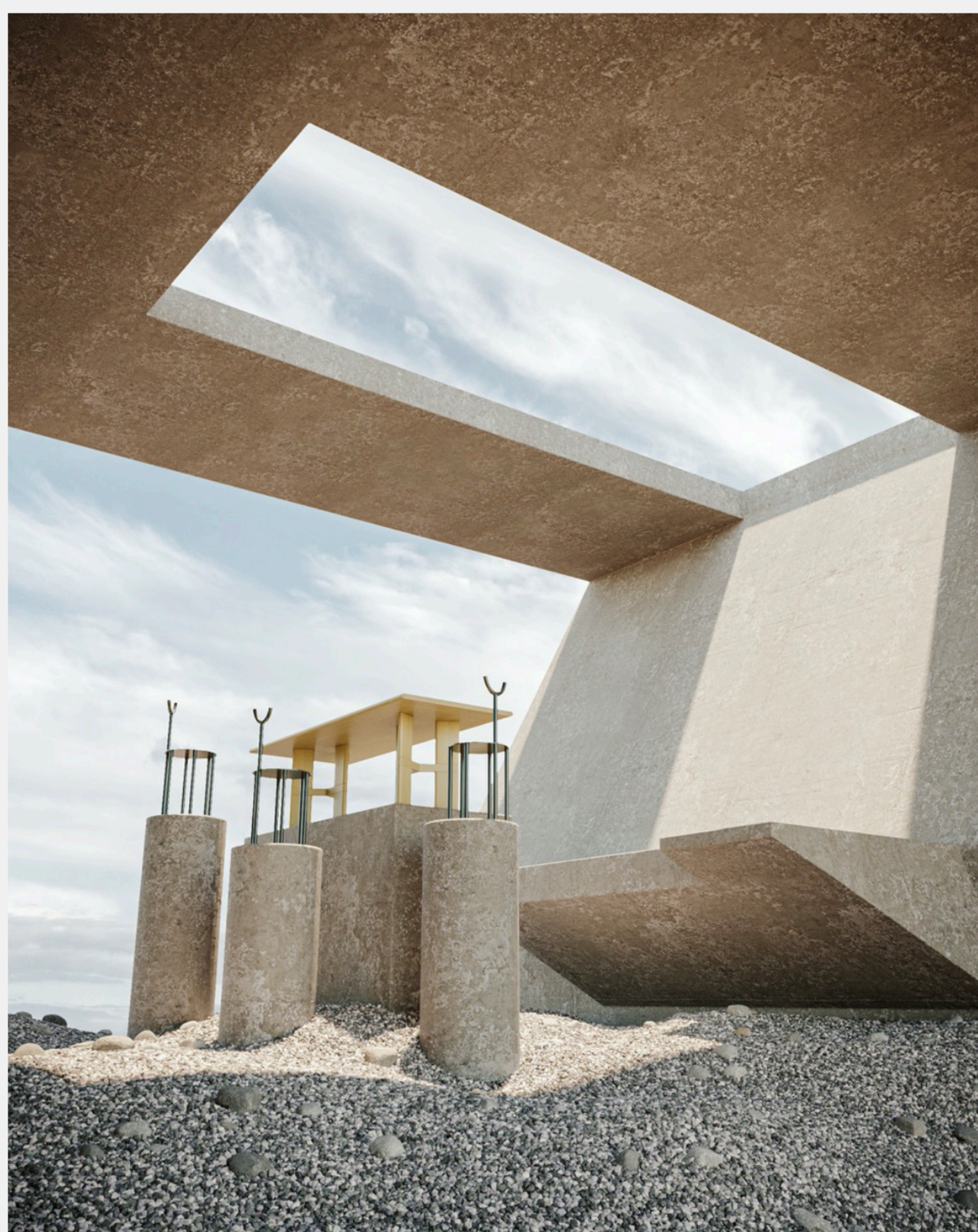
Featured in this scene: Room for Irregularities Chair by Walac, Elph Table by Wangan.